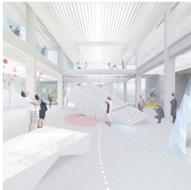
Vray for Sketchup Project By Our Faculty