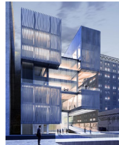
CALA Museum Sketchup/Vray/Photoshop