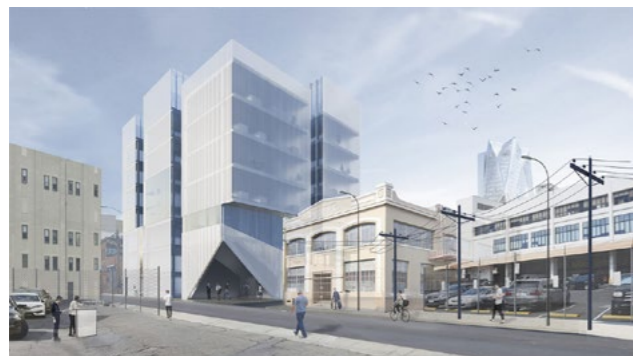
Vray for Sketchup Project By Our Faculty