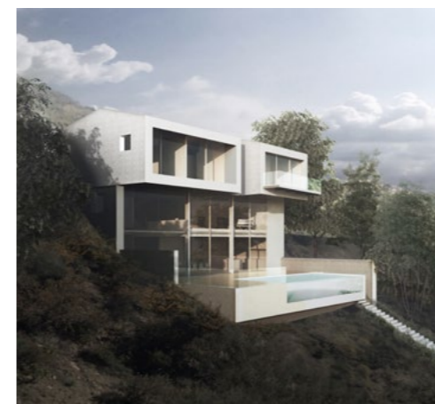
Oakview Dr Residence Sketchup/Vray/Photoshop