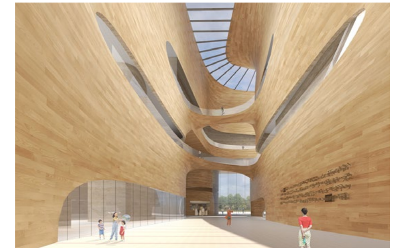
50 Mary St Rhino/Sketchup/Vray/Photoshop